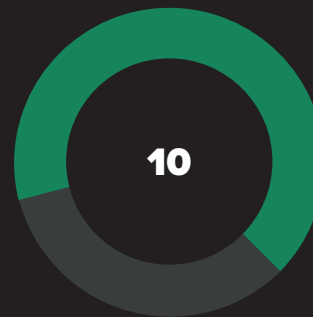
Issues per year